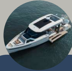
40FT Yacht (Max 10 guests ) SAXDOR 400 GTO