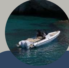
40FT Inflatable (Max 10 guests) ZEN 40