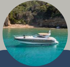
52FT Yacht (Max 15 guests) FAIRLINE TARGA 52